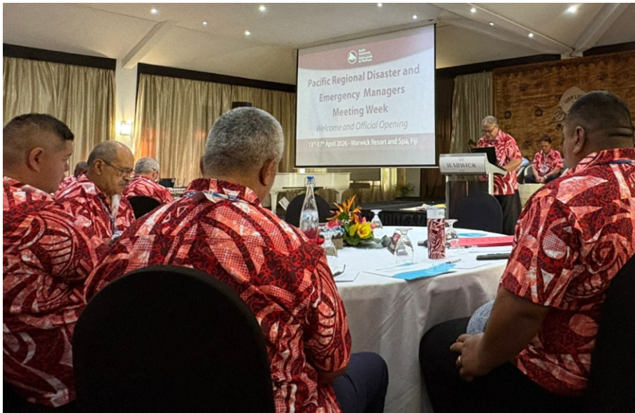
13-17 April 2026, NDRMO Tonga, alongside Tonga Fire and Emergency Services and Tonga Police, participated in the Pacific Regional Disaster and Emergency Managers Meeting (PRDEMM) in Sigatoka, Fiji