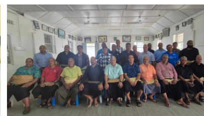
21 Nov: NDRMO & Tonga Red Cross conducted Tropical Cyclone Preparedness briefing for District & Town Officers