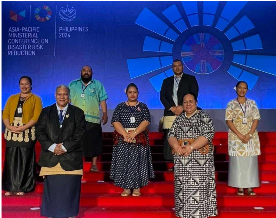
14-18 October: Tongan delegation at the Asia-Pacific Ministerial Conference on Disaster Risk Reduction (APMCDRR 2024) held in Manila, Philippines