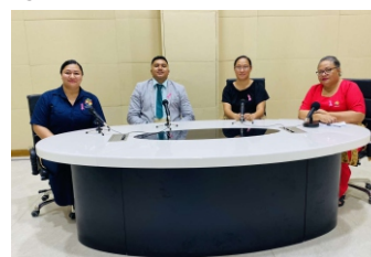
NDRMO team engages in week-long awareness campaign for International Day for DRR 2024