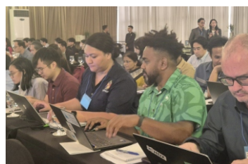
NDRMO GIS expert engages at 9th Joint Project Meeting for Sentinel Asia SETP-3