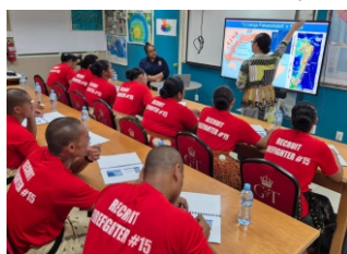
19 Nov: DRR Training session with Fire & Emergency Recruits