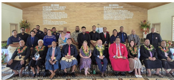
13 Oct: Marking International DRR Day with a special church service— deep gratitude to all partners & communities for fostering resilience