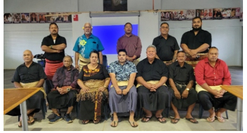
8 Nov: A group of gov/non-gov representatives, district & town officers trained on IDA in 'Eua