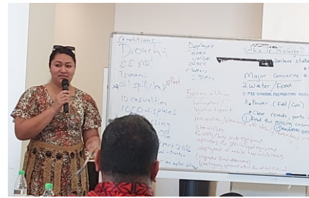
14 Nov: Humanitarian Assistance Disaster Response Workshop conducted by US Defense