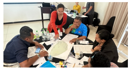
8 Nov: Building Resilience - SPC-NDRMO Training on Disaster Risk Assessment