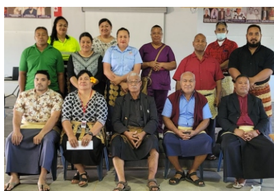
IDA training in 'Eua (7<sup>th</sup> – 9<sup>th</sup> Nov)